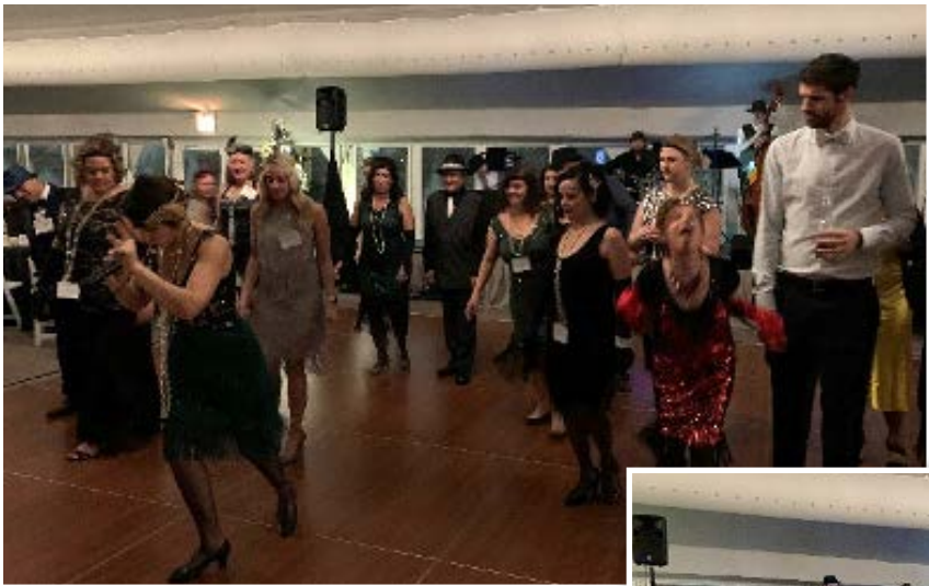
Party attendees learning to do the Charleston.