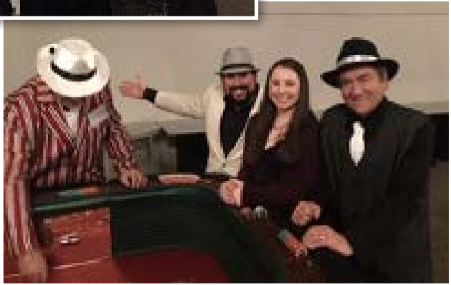
Decked out Roaring 20's style.