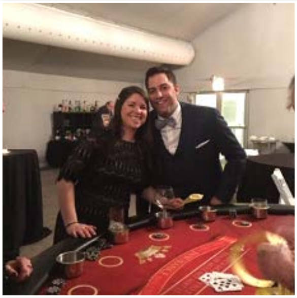
Trying their luck on the gaming tables